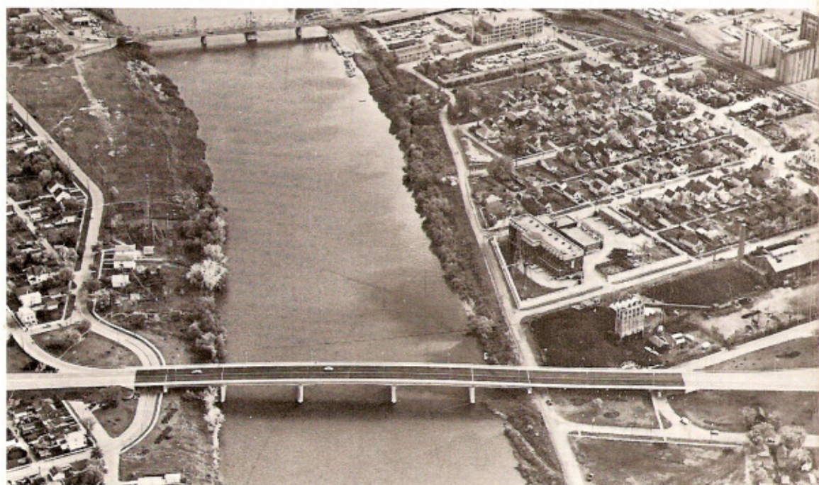
Disraeli Bridge opened October 20th, 1959.